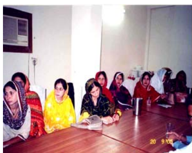
Community awareness workshop Distt Dadu

05.01.01: Pilot District level workshops. During the third quarter, two District level workshops were conducted for general community, CBOs and member of civil society organizations ex councilors and fresh candidates. The purpose was to orient the stakeholders about the formation and functioning of Musalihat Anjuamns and to highlight their role in the process. The workshops were split into two halves (two talukas in one half) so as to cover all the four talukas of each district. In district Shikarpur, the community workshop was conducted at Lakhi and Garhi Yaseen dated 17 th and 18 th August 05, attended by 55 and 49 participants respectively.