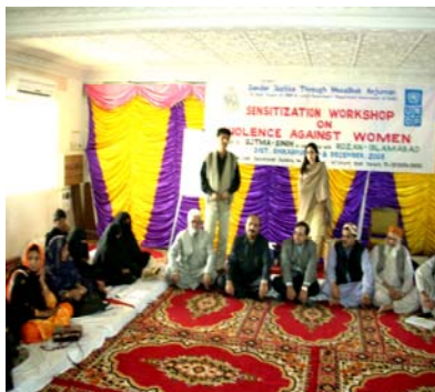
Workshop on Gender Sensitization & violence against women at Distt Shikarpur

Principal Law college and president district press club participated in the meeting (8 participants in total). The purpose of bi-monthly meetings was to bring the two important players in the formal justice system on one table for follow up of gender violence instances in the district.