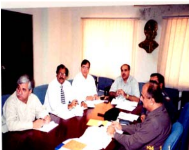
First PSC Meeting

02.04: Formation of Musalihat Anjuman in pilot Districts: The process of consultations and sensitization for the formation of Insaf Committees and Musalihat Anjumans were taken up with the provincial and concerned district governments as soon as the newly elected members took their oaths. GJTMA Sindh organized awareness workshops regarding the functioning of Musaliaht Anjumans among the opinion leaders, civil society organizations, bars and general community at a time when the elected bodies were dissolved and the process of elections for the new district governments were getting its momentum. The District Project launching ceremonies of the project were held during the new set up, presided by the Provincial Secretary Local Govt, which geared up the formation of Insaf Committees and Musalihat Anjumans in the pilot districts. The Insaf Committees and Musalihat Anjumans have now been constituted in both the pilot districts. In almost all the MAs constituted in UCs, the female participation was not there. The Project Management Unit took a serious stance and consulted the concerned district governments to ensure the participation of women as Conciliators. The panels of Musalihat Anjumans are in the process of reconsideration . Encouraging reports have been received from the districts in this regard (Received lists of MAs/ ICs attached at annexure 3 ).