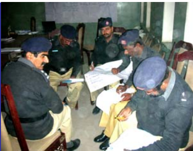
Group activity at orientation workshop for Distt Police Dadu