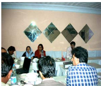
Periodic Meeting with stakeholders at Distt Dadu

Capacity building of the Union Administration has a prime importance to effectively support the MAs in their service delivery and record keeping. This element was kept alive during the training workshops/ consultations for UCs and MAs so far being taken during the year. In the year 2006, more extensive trainings will be imparted to MAs/ U.As to fully equip them with the required knowledge/skills for effective functioning.